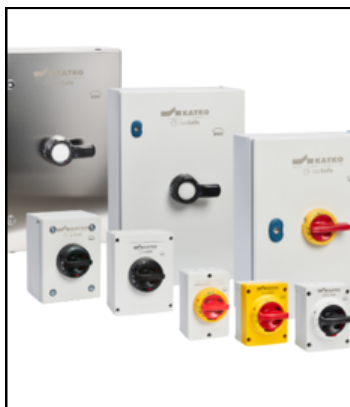
IP 66 ISOLATORS