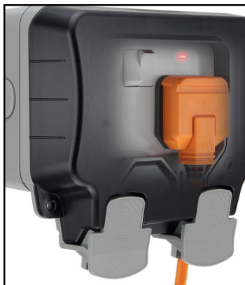
IP66 SWITCHES + SOCKETS