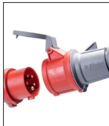
IP 67 INDUSTRIAL PLUG & SOCKETS