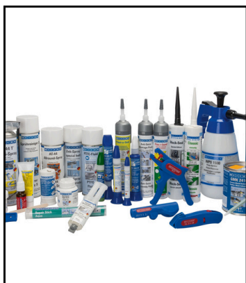
ADHESIVES & SEALANTS, TECHNICAL SPRAYS