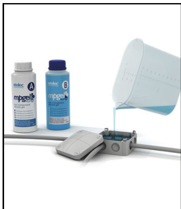
IP68 TWO COMPONENT GEL