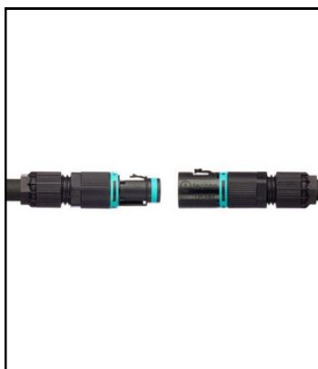
IP68 CABLE CONNECTORS