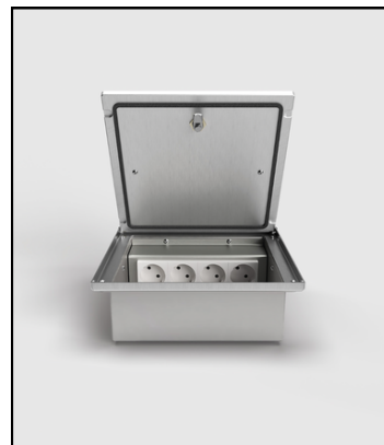
IP65 FLOOR SOCKETS