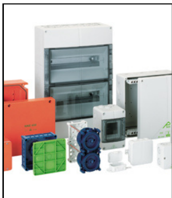
IP 66 JUNCTION BOXES, DISTRIBUTION BOARDS